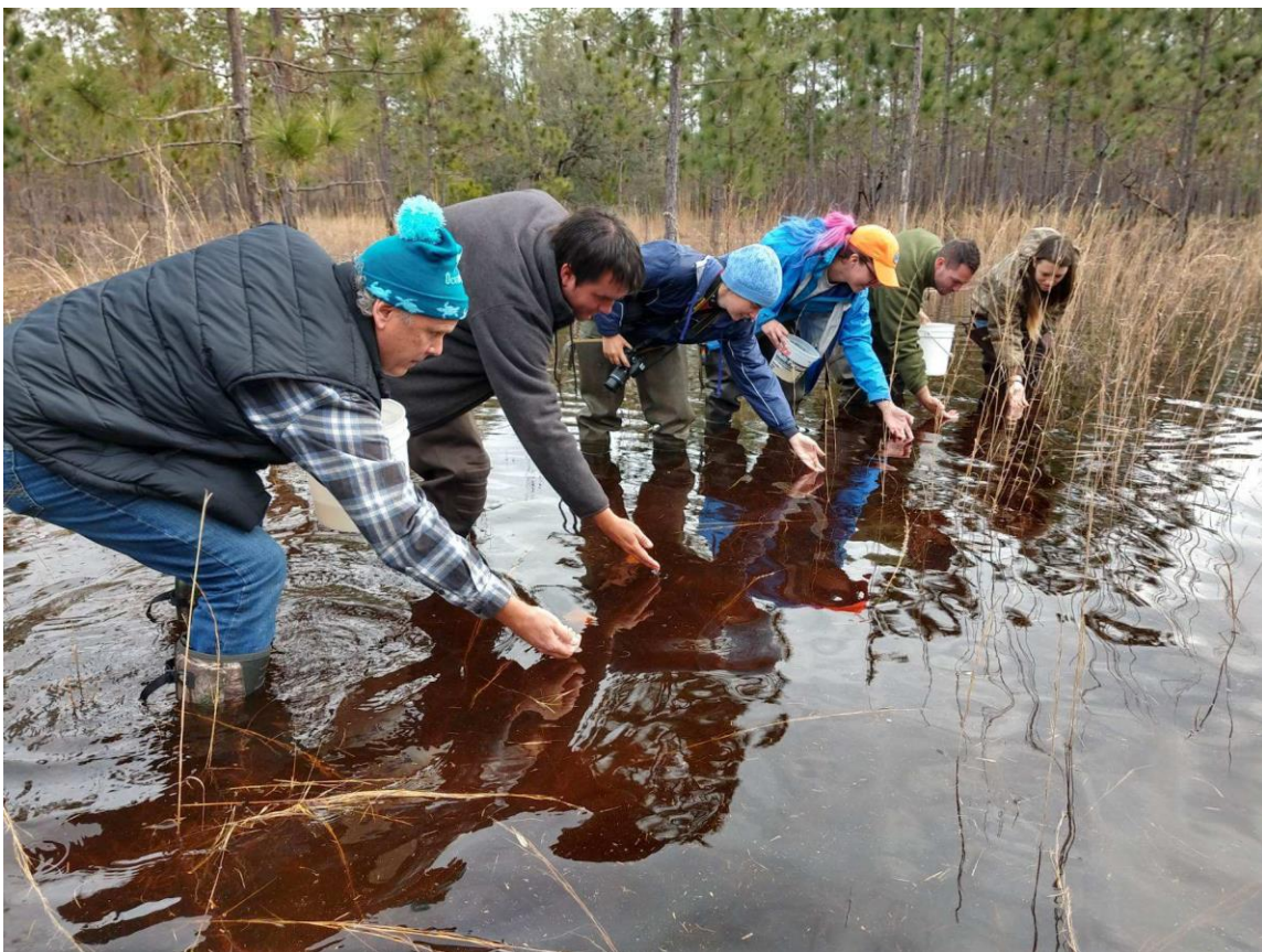
February 2019 Striped Newt Release Event. CPI members at the Caudata level are invited to participate in our striped newt releases.